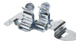
MSP3 - 6