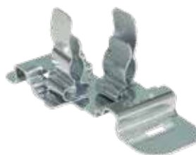
MSPC 3 - 7