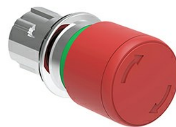
Mushroom head pushbutton, Latch, turn to release Ø 30mm/1.2" LPSB663